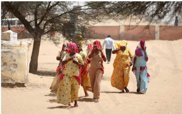
Taking cover: Women cover their faces to protect from heat at Bikaner in Rajasthan on April 19.

Instead of just focusing on the frequency and the intensity of heatwaves, the study also checked how fast they were propagating and how long they lasted. By